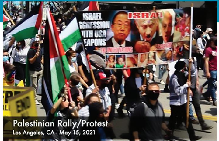
At a protest in Los Angeles, CA on May 15, 2021, protestors held a sign brandishing Israeli Prime Minister Netanyahu with a Hitler moustache eating a Palestinian child that is beyond offensive. The antisemitism conveyed in this image is centuries in the making.

The Blood Libel accuses Jews of murdering non-Jewish children to use their blood for ritual purposes, such as making Passover matzah. Blood libel charges have evolved from Medieval times into a widespread blame of Jews or Israelis for horrific crimes against Palestinian children, such as eating Palestinian children and drinking their blood, or purposefully targeting and killing them.