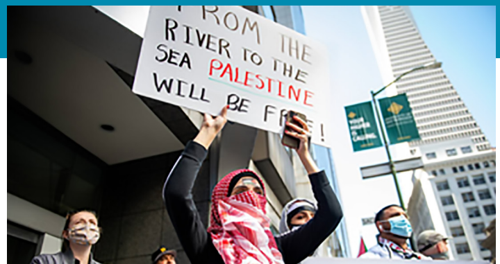
RIGHT: In San Francisco, CA on May 18, 2021, a sign says: "From the River to the Sea, Palestine will be Free!"

"From the River to the Sea" is a catch-all phrase that symbolizes Palestinian control over the entirety of Israel's borders, from the Jordan River to the Mediterranean Sea. This saying seeks to eliminate the State of Israel and is a historic call-to-arms for terrorist groups and their sympathizers, from the Popular Front for the Liberation of Palestine (PFLP) to Hamas.