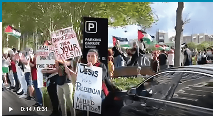
At a protest in Miami, FL on May 16, 2021, a sign says "Jesus was Palestinian and you killed him too!" The Deicide charge was also seen on signs and on social media.