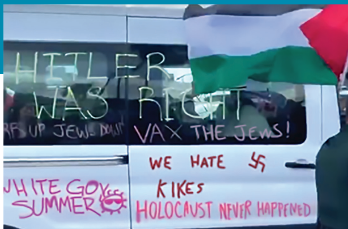
ABOVE: White supremacists in Boca Raton, FL on May 12, 2021, drove a van saying “Holocaust never happened” and “Hitler was right” while waving a Palestinian flag, to provoke Jews who were peacefully demonstrating in support of Israel.

On May 11, 2021 on the Daily Show, host Trevor Noah spoke about Israel’s military might, comparing Israel to himself, as a big brother, fighting with his younger brother: “As a person who has immensely more power, I had to ask myself whether my response to this child was just or necessary,” he said. “Could I find different ways to deal with this?” Noah is suggesting that because Israel “has more power,” it should not respond as forcefully when a terrorist organization—which is on record saying its primary goal is the destruction of Israel—is bombarding it with rockets.