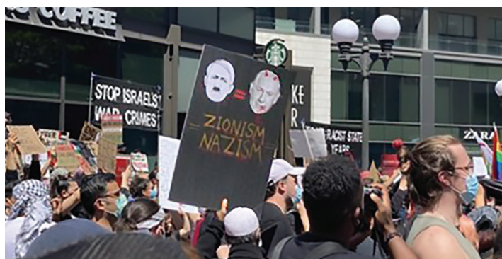
BELOW: A sign at a rally in Seattle, WA on May 16, 2021 shows Adolf Hitler side-by-side Israeli Prime Minister Benjamin Netanyahu, saying “Zionism=Nazism.”